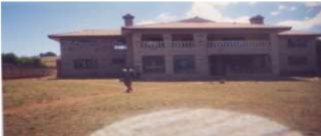
House for Maishilio Ltd Runda Estate, Nairobi