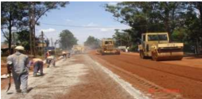
Access Road to Mumias Sugar Company, Road Base Construction