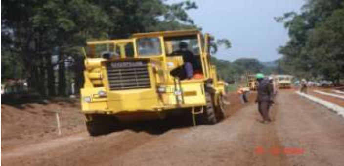
Cement Stabilization of the road base

Road condition assessment including inventory surveys