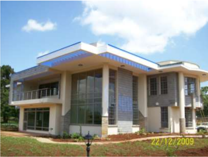
The James Residence, Karen Nairobi. Side view