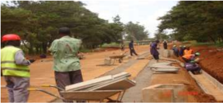
Company, Drainage Works