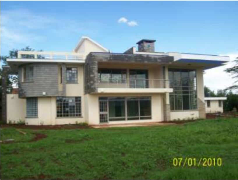
The James Residence Karen, Nairobi, Rear view