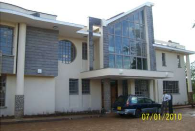
The James Residence Karen, Nairobi. Front View